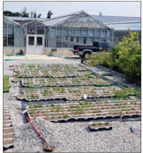
Experimental 'green roof.'