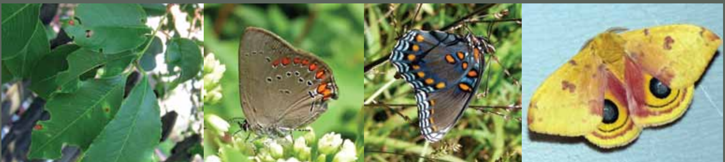
Left to right: Insect damaged black cherry leaves, coral hairstreak (butterflies), and red spotted purple, io moth.