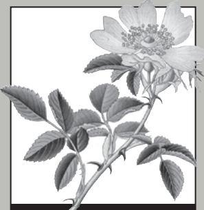
Year of the Rose

A Publication of the Maryland Native Plant Society