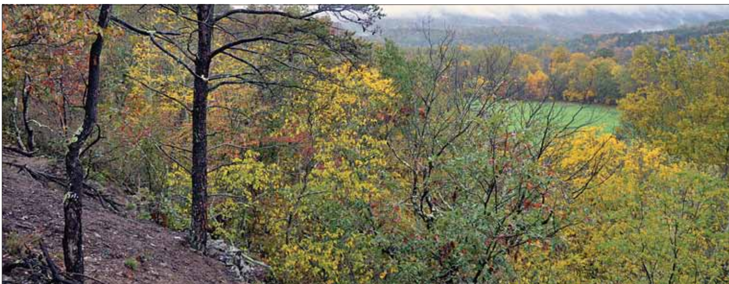
View from the top of a shale barrens site in western Maryland in mid October.

step is to identify the characteristics of the environment. Green roofs are engineered systems designed primarily to capture storm water and reduce the temperature extremes experienced by the roofs (Obendorfer et al., 2007). They are composed of layers on top of waterproof membranes. The layers can take various forms, but they comprise four basic categories: a drainage layer, a root barrier, a mineral-based substrate and plant material. Green roofs fall into two classes based on the depth of the substrate layer. “Extensive” green roofs are those with a substrate depth generally less than 6 inches. Green roof systems with greater depth are generally considered “intensive” green roofs. Extensive green roofs are more common due to lower installation and maintenance costs; thus they have potential to be used as conservation space for native xerophytes (Peck et al., 1999).