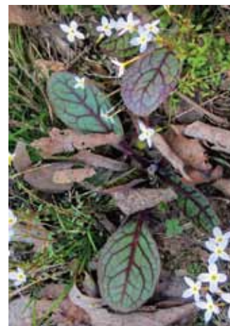
Basal leaves, quiz plant #2, with flowers of Houstonia caerulea (Bluets).

3. MNPS field trippers at Loch Raven Watershed and at the McKeldin area of Patapsco State Park exclaimed at the tropical look of these trees, which seemed out of place in oak-hickory-tulip forests. This species is indeed native, but uncommon, ranked S3 (state watch list). This tree is far from the tallest in the forest, but it has the largest simple entire leaves of any native plant in Maryland—often exceeding 20 inches in length. These huge deciduous leaves are in whorl-like clusters at the ends of branches. The big white flowers appear in May.