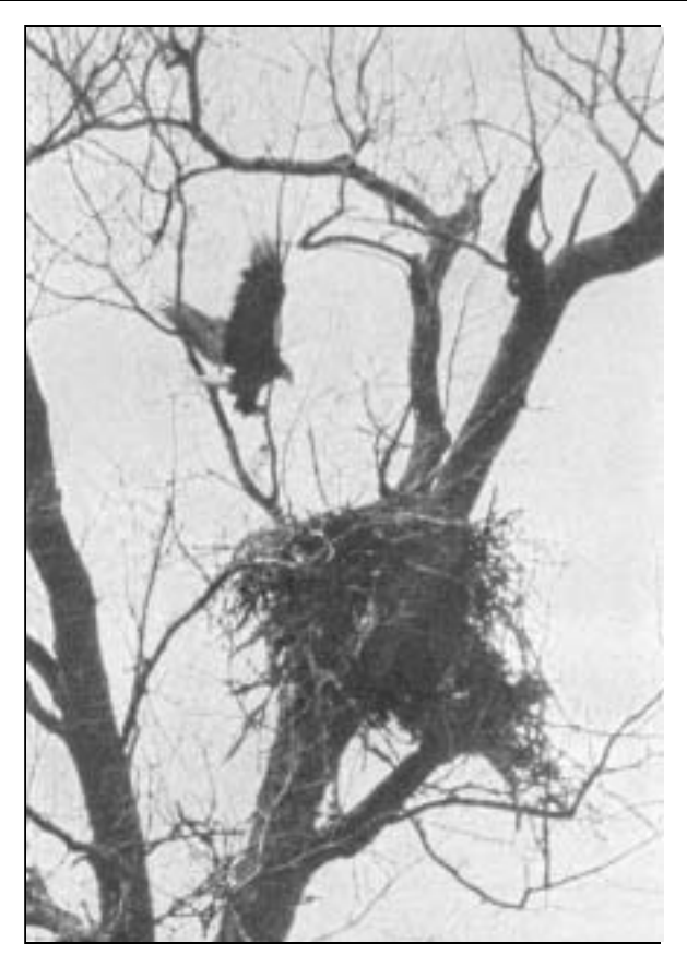
Bald Eagle at Nest