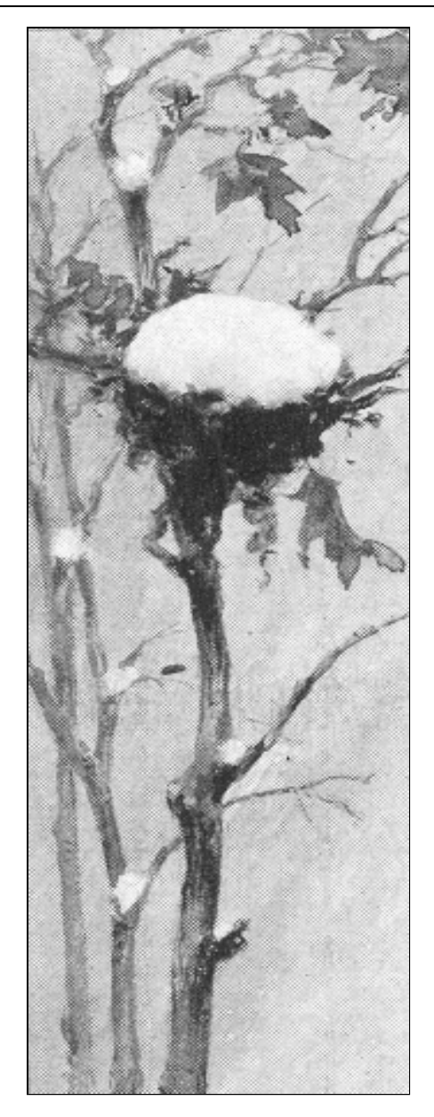
"In wildness is the preservation of the world." ~Thoreau

Wildlands designation limits the types of activities that may occur on State lands to those activities that do not leave a lasting imprint of human activity. Prohibited activities generally include the use of motorized vehicles and equipment, the harvesting of timber, the use of land for commercial gain, mineral extraction, and the construction of new roads, buildings, and structures. Several types of